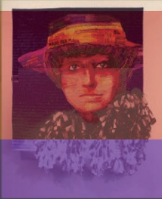
Deeds Not Words: Celebrating 100 Years Of Women's Suffrage