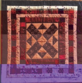
Florida Quilt Study Group: Antique Quilt Block Challenge