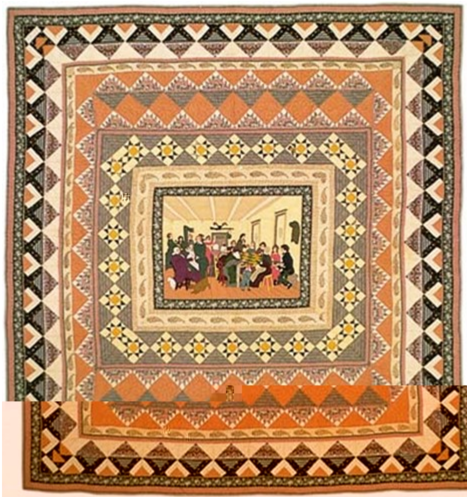
The Quilting Party. Illinois State Museum

This is another quilt where detail reigns supreme. I saw this beauty in person about five years ago. Look at some of the tiny, precise additions which add so much to the “picture” in the middle.