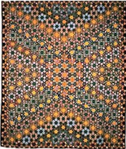
Star and Hexagon. Illinois State Museum