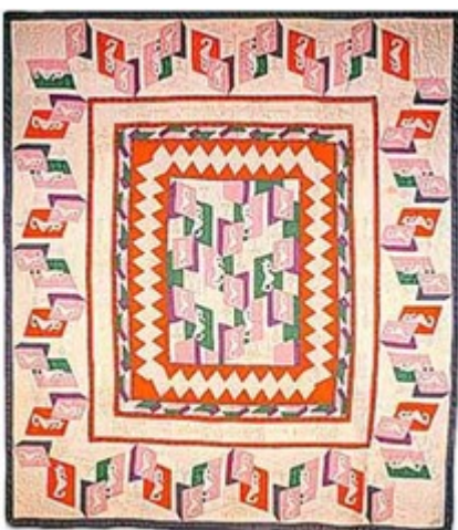
OPA Quilt (Office of Price Administration). Illinois State Museum.

This quilt is pieced in a secondary palette of purple, orange and green, showing a good grasp of the color wheel, and inverts the central medallion format in a way that is innovative while still being controlled. Stenge made other hexagon quilts which can be seen in the Illinois State Museum collection.