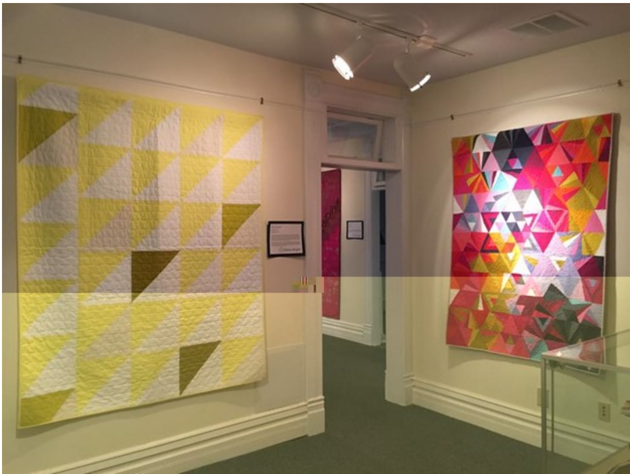
Trip the Light Quilt Tessellation Quilt

Transformation of the Patchwork Quilt," Sociological Perspectives. Vol 46, Number 4, 2003