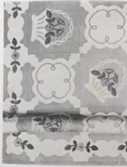
This popular Quilt has white baskets of pink roses on a blue ground, and blue scroll on white ground.