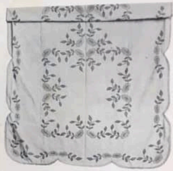
This spread can be furnished in either pink or yellow, on a white or unbleached foundation.