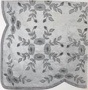
Can be furnished in two shades of pink or yellow.