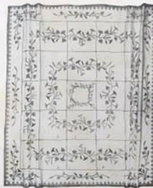
The Morning Glory design comes in two shades of blue or pink and in combination of colors.