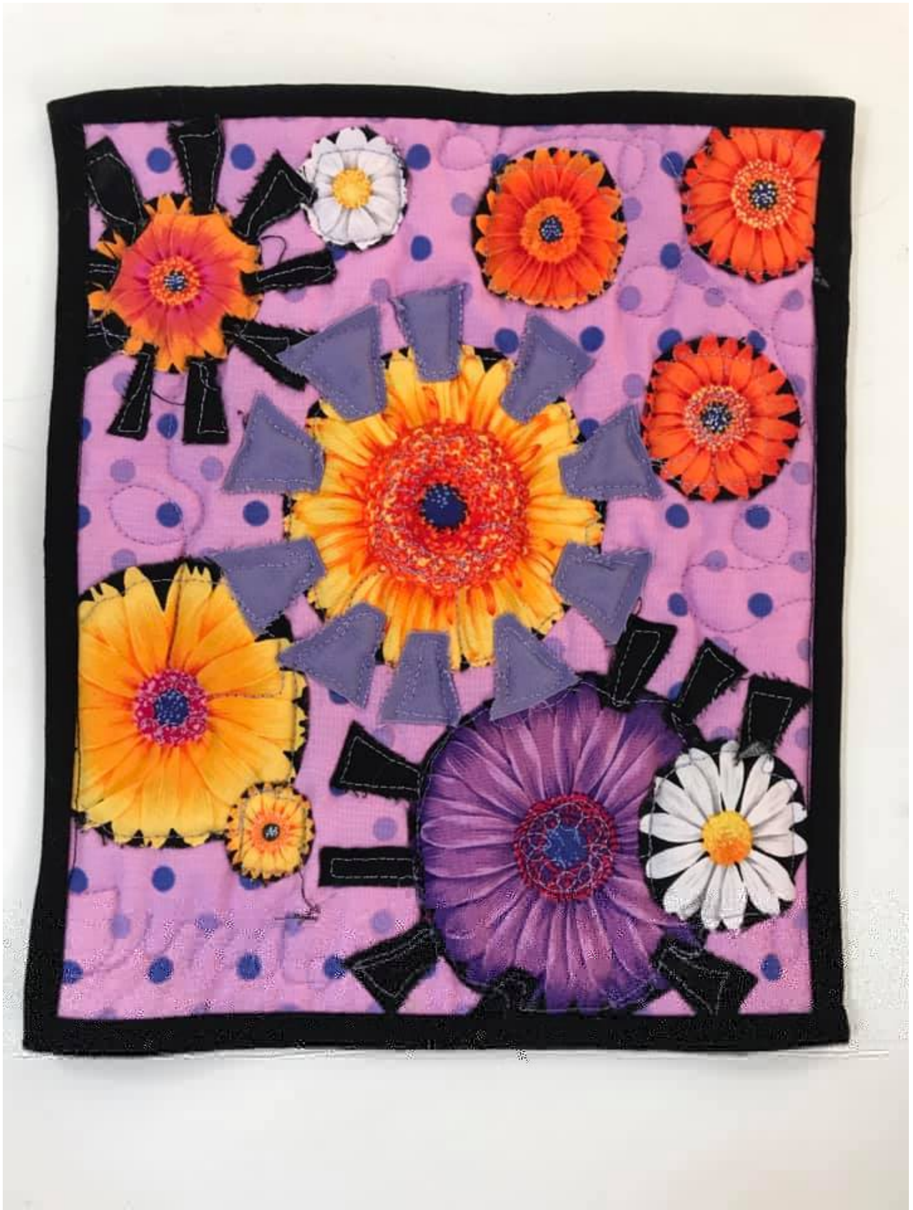
Tina Geyer - Raw edge appliqué, 2016